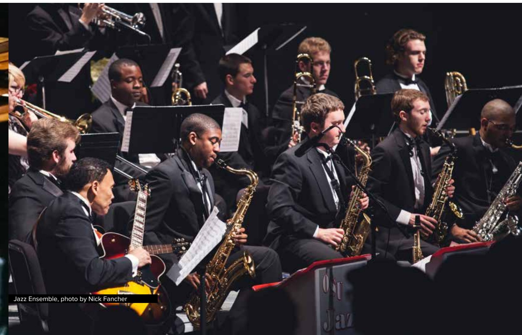
Jazz Ensemble