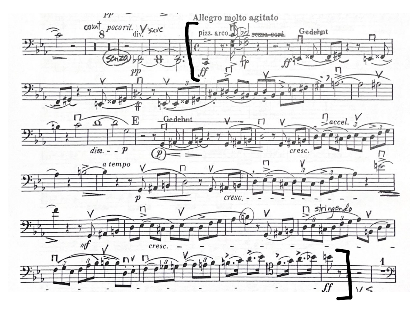
Death and Transfiguration Excerpt 2: 7 measures before P through 10 after P